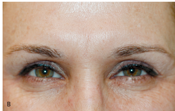
Figure 7. Dynamic frown lines with glabellar complex muscle contraction ( A ) before and ( B ) one month after onabotulinumtoxinA (Botox) treatment.