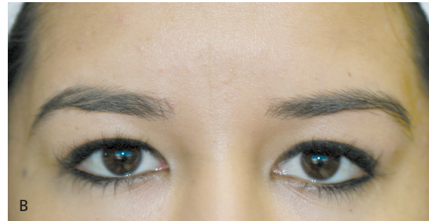
Figure 4. Ideal candidate for botulinum toxin treatment demonstrating (A) dynamic frown lines with glabellar complex muscle contraction and (B) lack of static lines with glabellar muscles at rest.