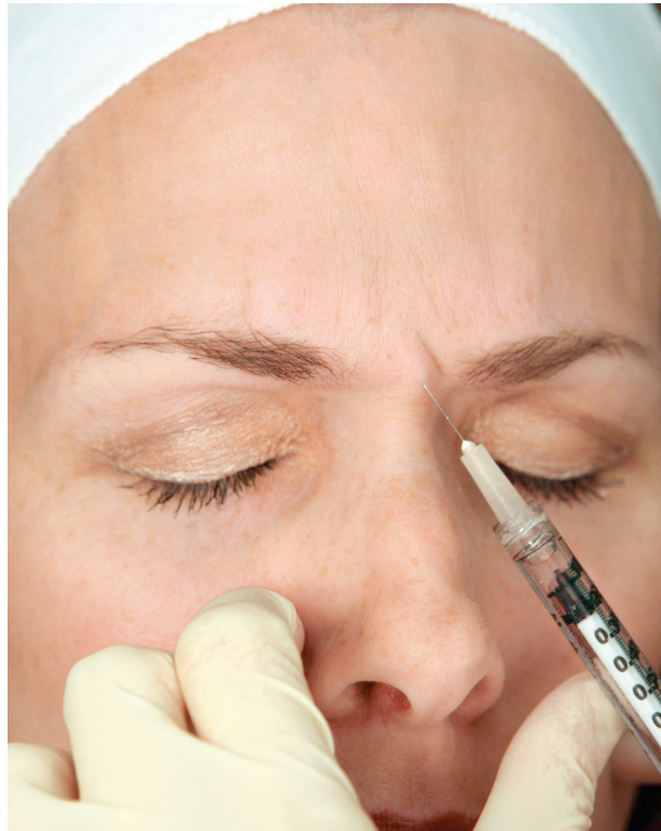
Figure 6. Botulinum toxin injection into a contracted glabellar complex muscle.